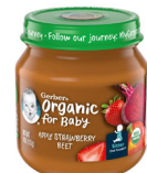
Apple Strawberry Beet