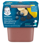
Banana Blackberry Blueberry