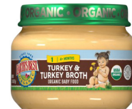
Turkey & Turkey Broth