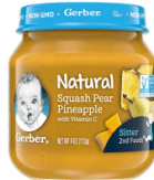
Squash Pear Pineapple