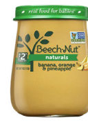
Banana Orange Pineapple