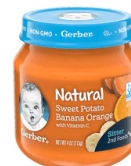
Sweet Potato Banana Orange