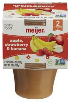
Apple Strawberry Banana

Meijer brand foods only; 2-4-ounce plastic twin-pack; Only the specific types as listed: