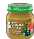
Apple Spinach Kale