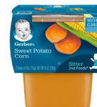
Sweet Potato Corn