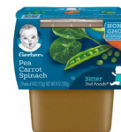
Pea Carrot Spinach