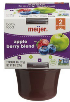
Apple Berry Blend