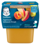
Apricot Mixed Fruit