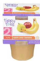
Apple Pear Banana