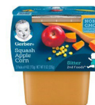
Squash Apple Corn