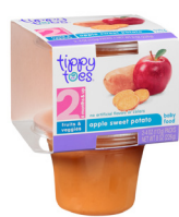
Apple Sweet Potato