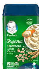
Oatmeal Millet Quinoa