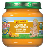
Corn Butternut Squash