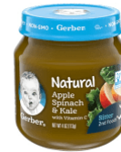
Apple Spinach Kale