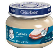
Turkey & Gravy