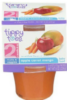
Apple Carrot Mango