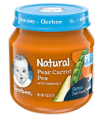
Pear Carrot Pea