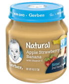
Apple Strawberry Banana