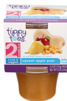
Squash Apple Pear