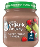
Pear Purple Carrot Raspberry