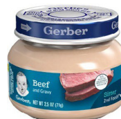
Beef & Gravy

For exclusively breastfeeding participants only; Gerber brand second foods only; 2.5-ounce glass jars only; Only the specific types as listed below: