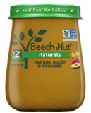
Mango Apple Avocado