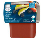
Carrot Pear Blackberry