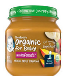
Mango Apple Banana