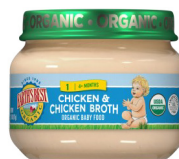
Chicken & Chicken Broth

For exclusively breastfeeding participants only Earth's Best Organic brand; 2.5-ounce glass jars only; Only the specific types as listed below: