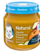
Apple Zucchini Peach