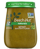
Spinach Zucchini Peas