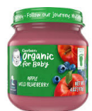
Apple Wild Blueberry

Gerber® 2nd Foods® Organic; 4-ounce glass containers only. Only the specific types as listed below: