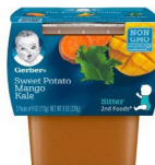
Sweet Potato Mango Kale