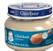
Chicken & Gravy