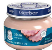
Ham & Gravy