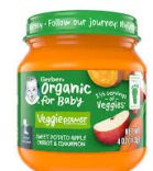
Sweet Potato Apple Carrot Cinnamon