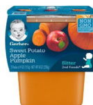
Sweet Potato Apple Pumpkin