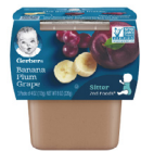
Banana Plum Grape