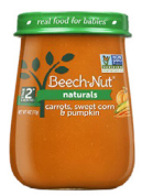
Carrots Sweet Corn Pumpkin